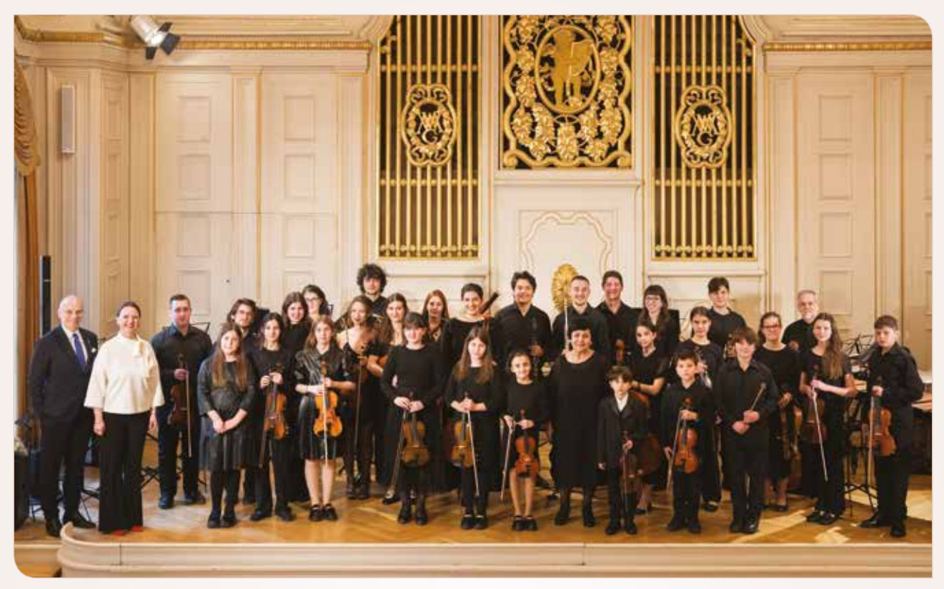
Mozarteum Hellas concert at International Mozarteum Foundation | 10 March 2024