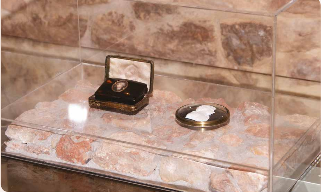
The Grassi-Medaillon & Posch-Medallion were presented in an exclusive event to Mozarteum Hellas members. These two objects had never been put before on display outside the museums in Salzburg.