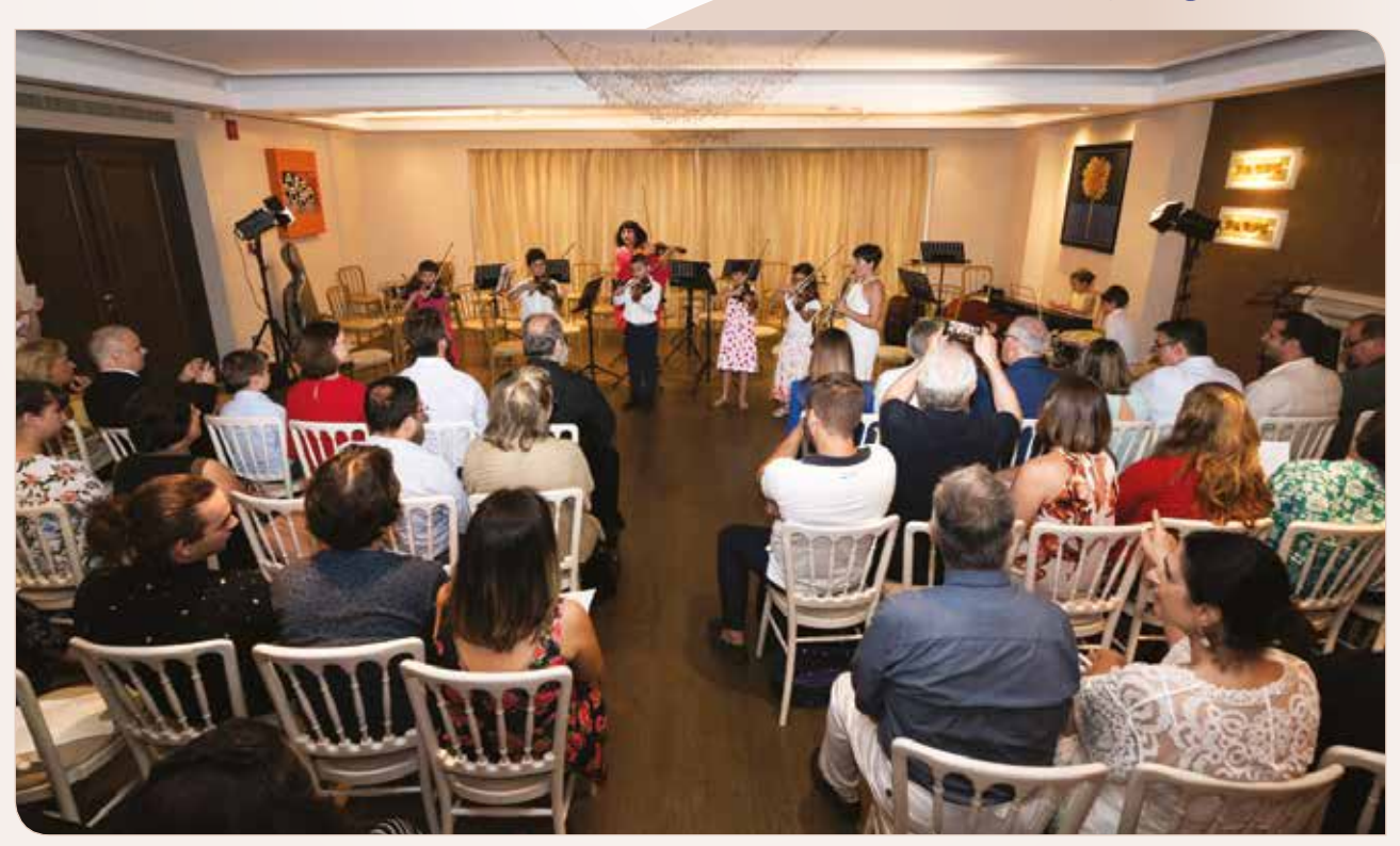
On the occasion of the completion of the pilot programme 2019 Summer Music Academy a concert was held at Ecali Club.