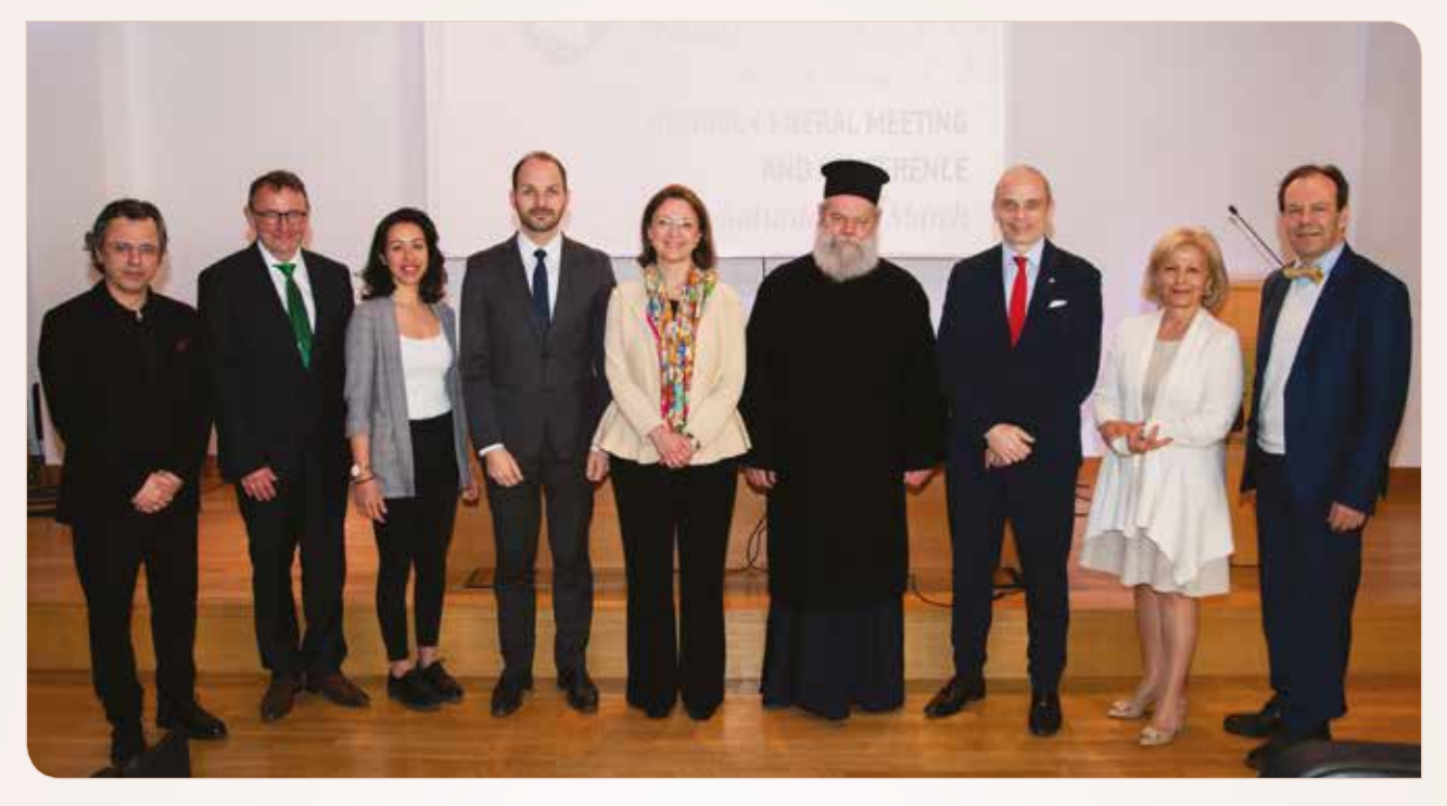
The Annual General Meeting and Conference of Mozarteum Hellas took place on Saturday 11 March 2023 in the Culture Centre of the Holy Archdiocese of Athens.