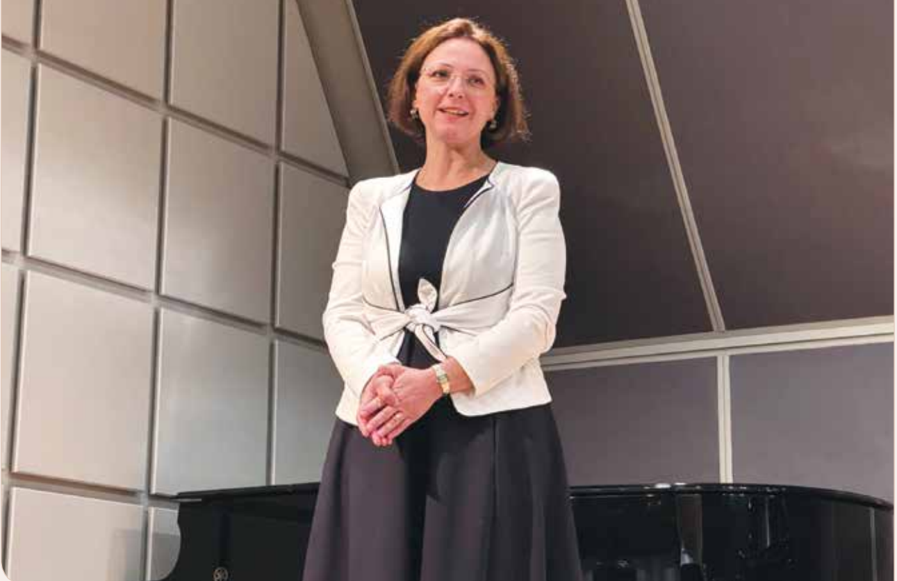
Mozarteum Hellas in cooperation with Mozarteum University of Salzburg and under the auspices of the Austrian Embassy in Greece organised for the first time Masterclasses for violin and piano that took place over four days in two different venues of the Philippos Nakas Conservatory.