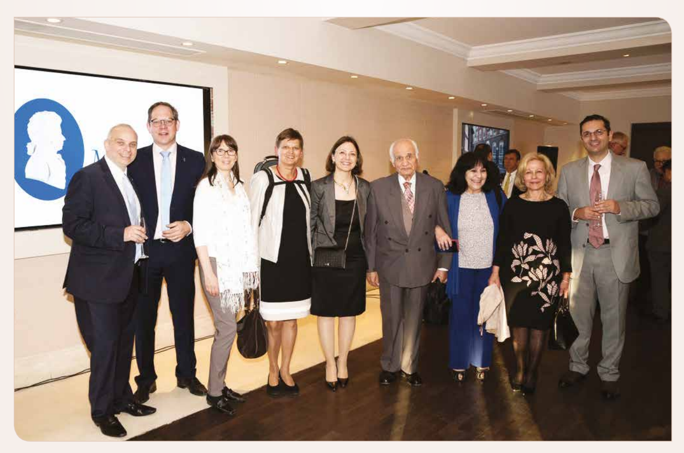
Mozart's Costa violin has only traveled to eight countries and for the first time came in Greece.