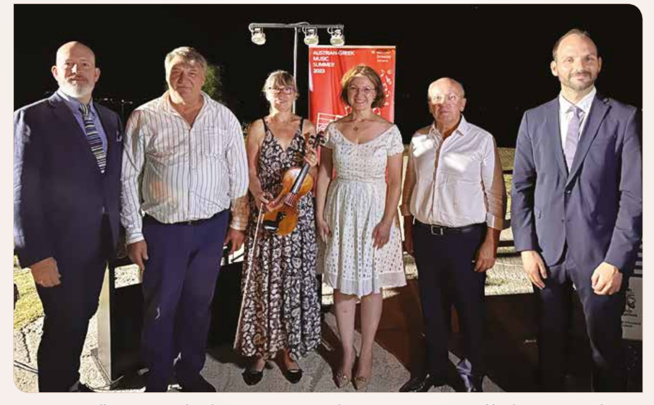
Mozarteum Hellas participated in the 2023 Austrian-Greek Music Summer organised by the Austrian Embassy in Athens Marathon Municipality.