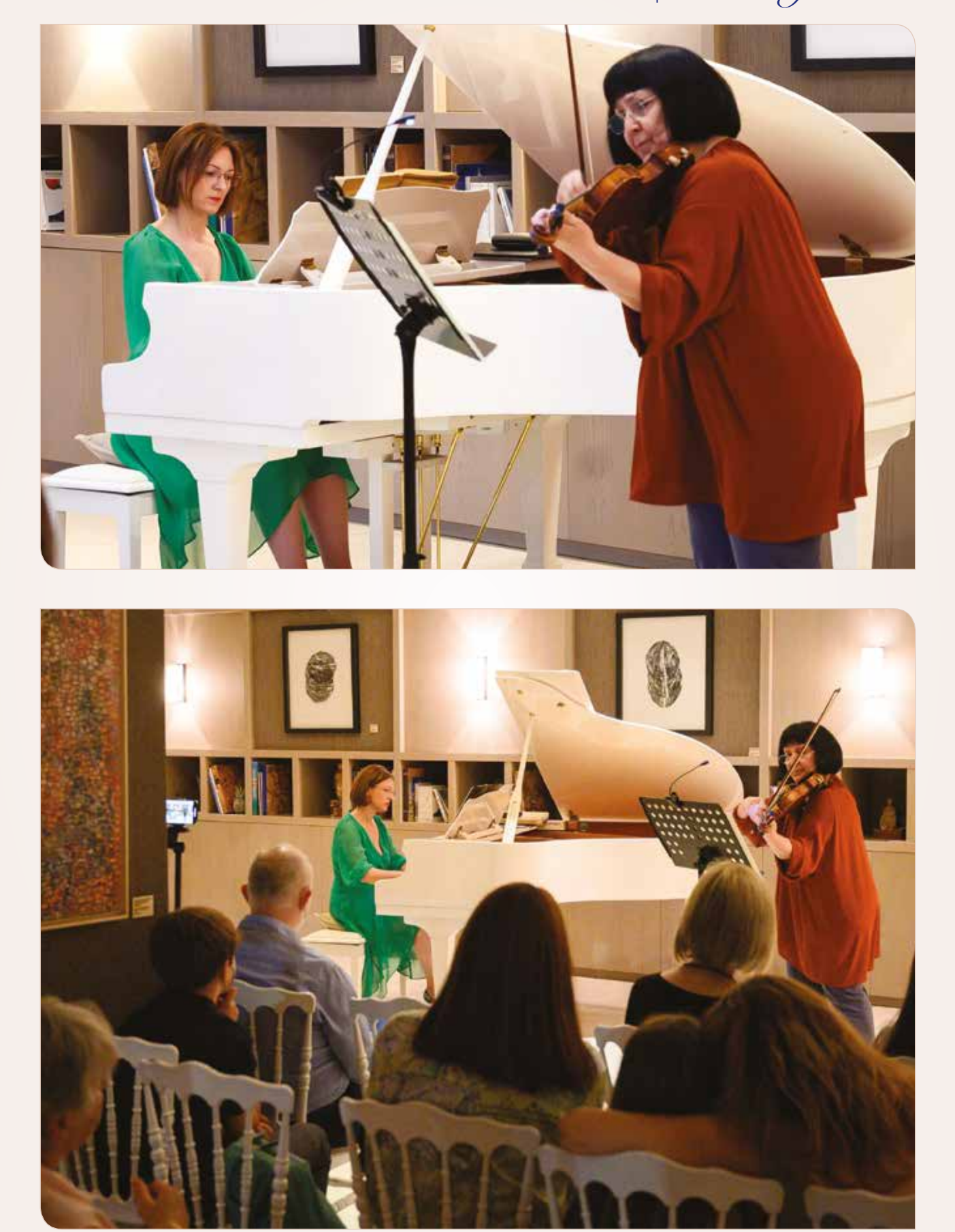
The 2022 Mozarteum Hellas Summer concert was held in Ecali Club.