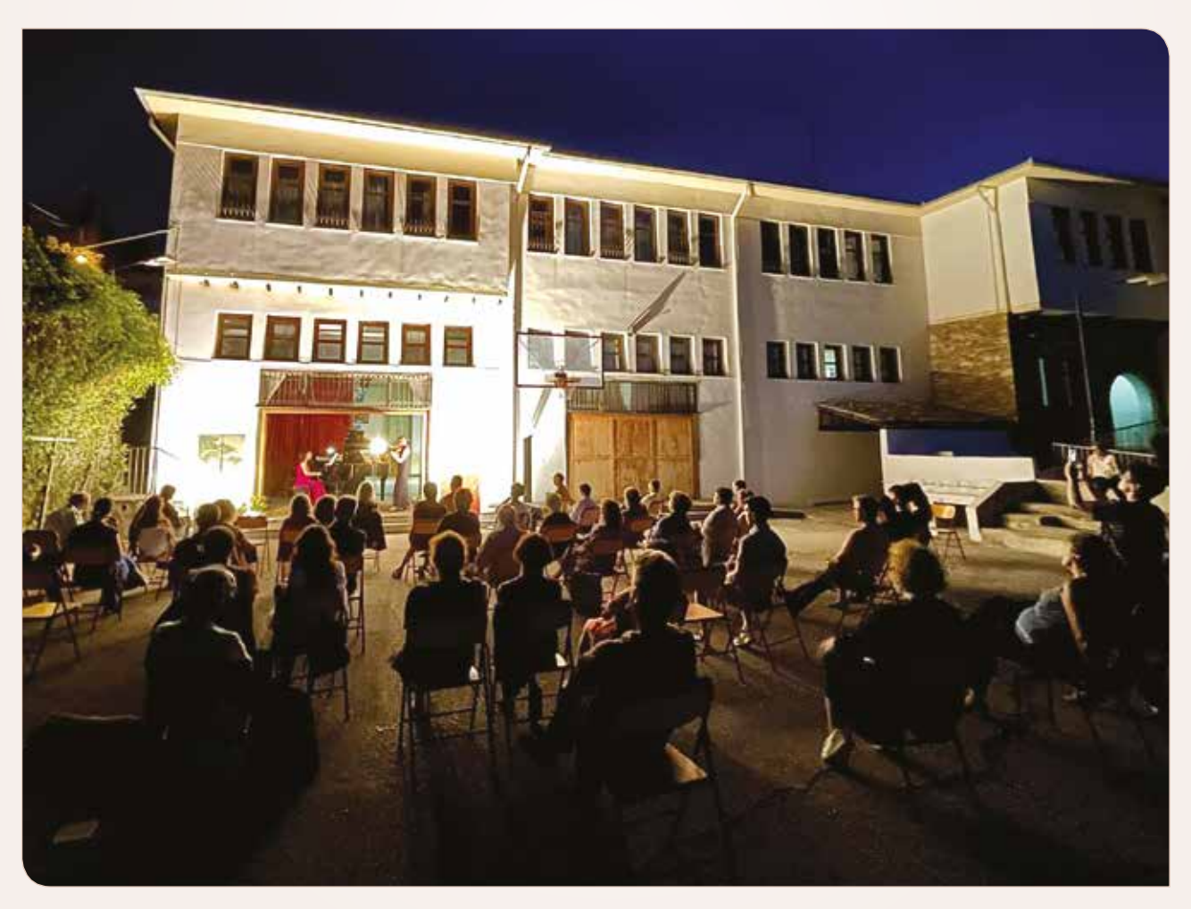
The 30th Nafplion Festival concert and the 21st International Pelion Festival concert part of the 2021 Austrian-Greek Music Summer were under the auspices of Mozarteum Hellas.