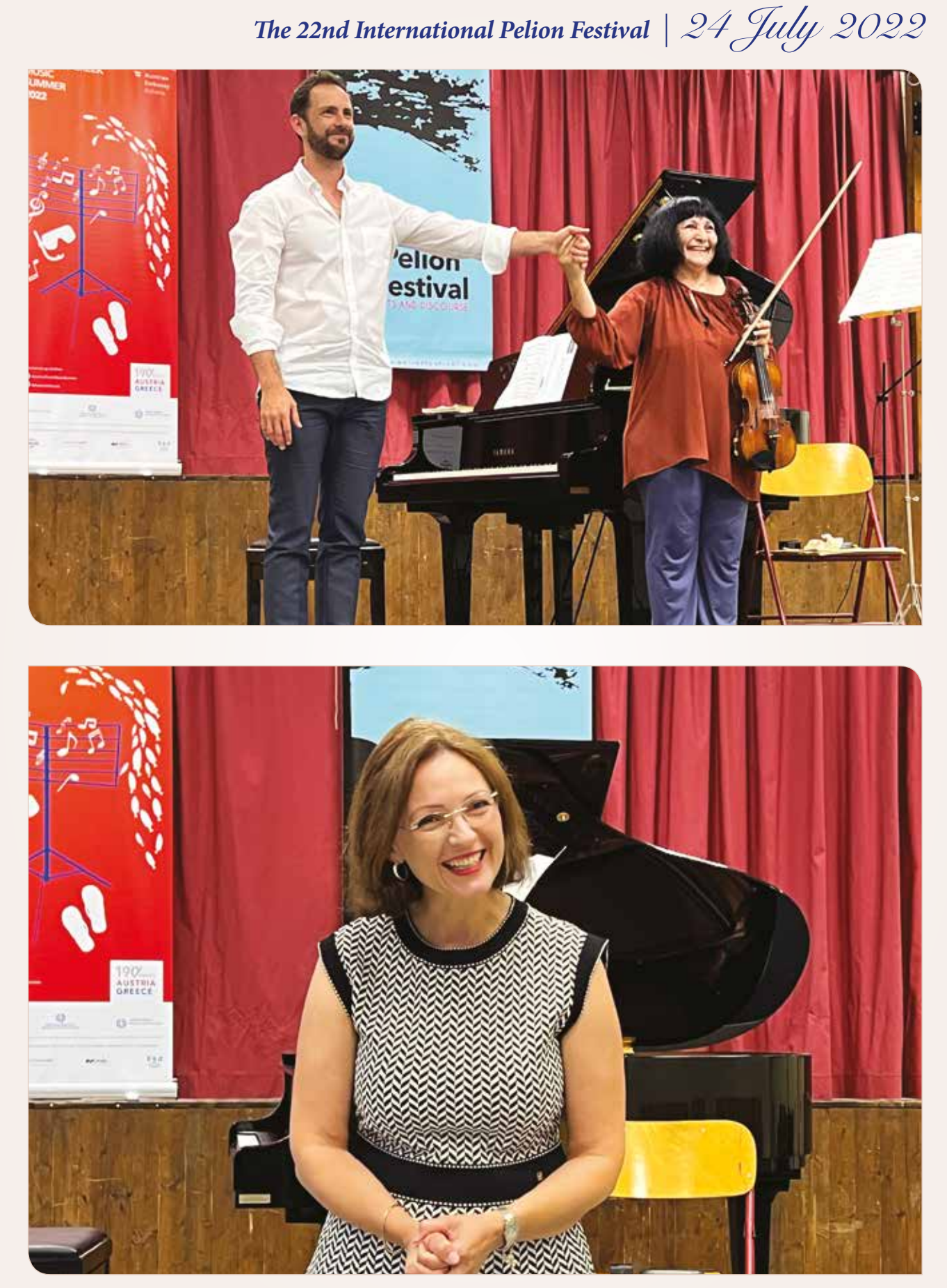
Mozarteum Hellas participated with two concerts in the 2022 Austrian-Greek Music Summer organised by the Austrian Embassy in Athens.