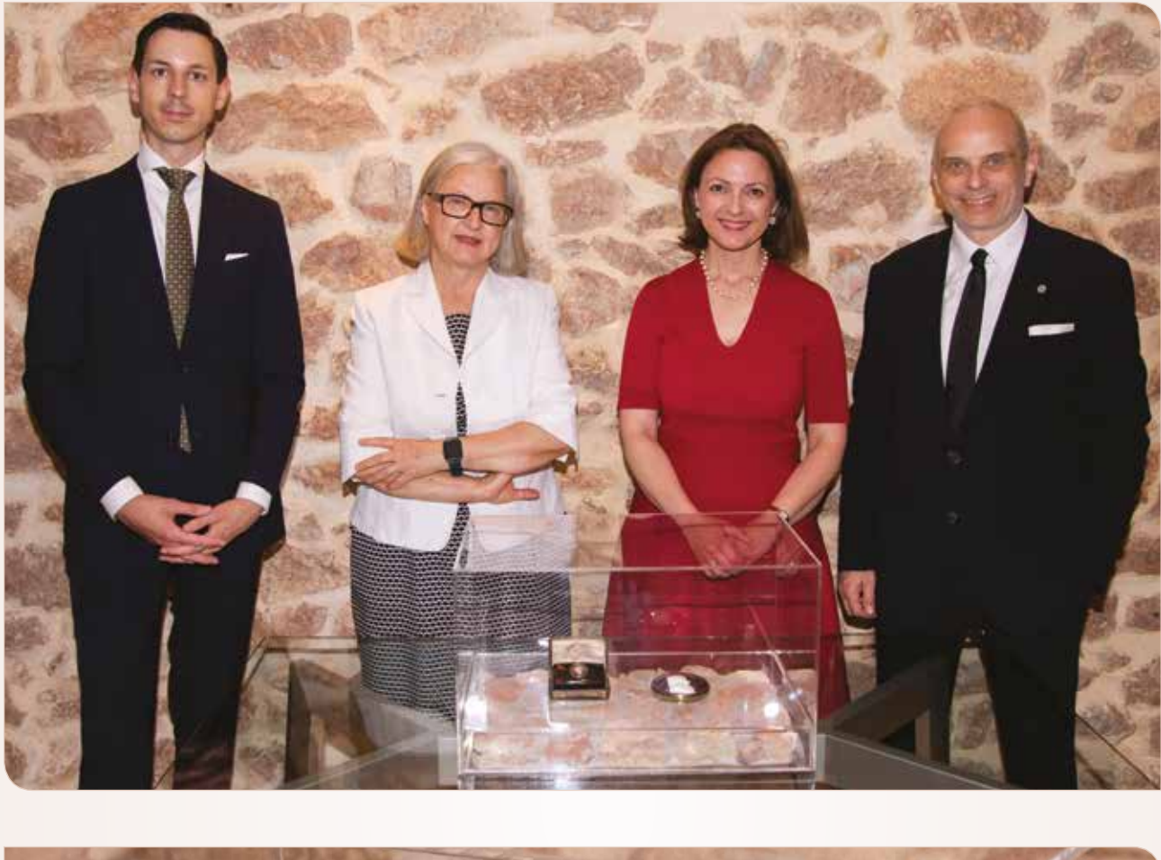
The Grassi-Medaillon & the Posch-Medallion \mid 21~May~2022