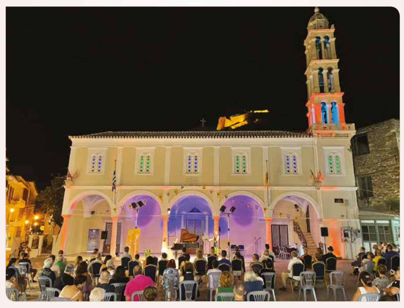
For the first time Mozarteum Hellas participated in the 2021 Austrian-Greek Music Summer organised by the Austrian Embassy in Greece.