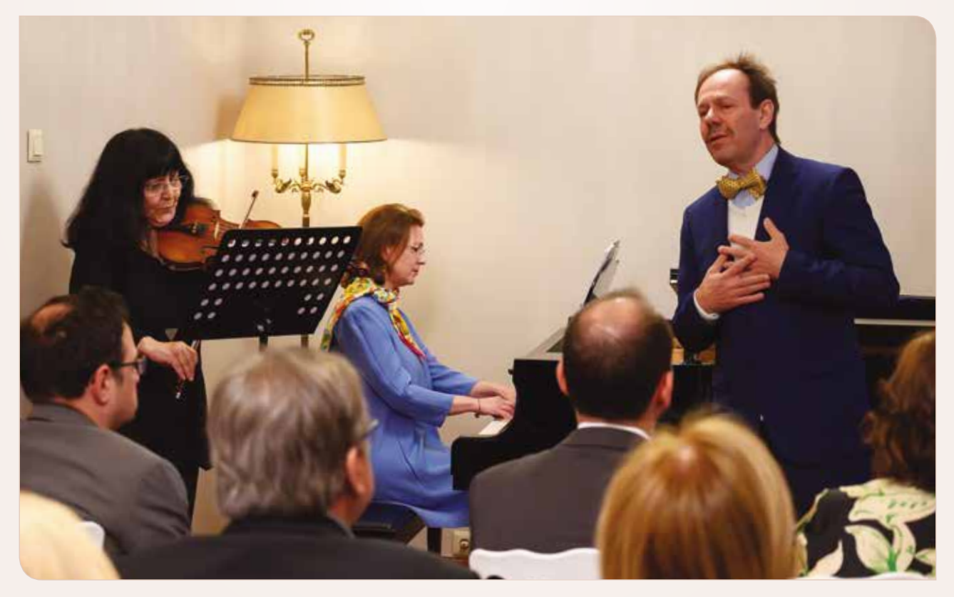
Mozarteum Hellas and Mozartgemeide Wien, signed a Memorandum of Understanding in Athens aiming at strengthening cooperation and exchange of ideas.