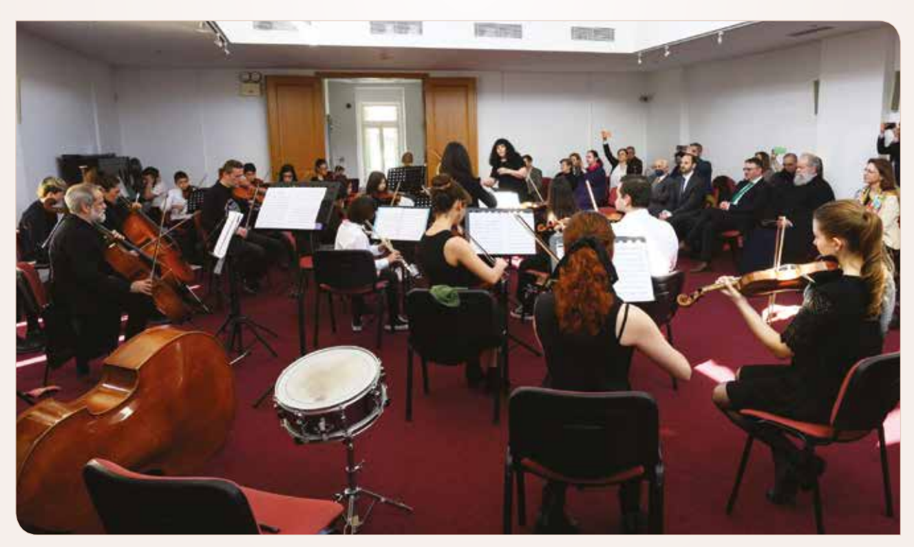
The event concluded with a concert of the Children Youth Symphony Orchestra (PNSO) at Wiener Saal of the Foundation in Salzburg.